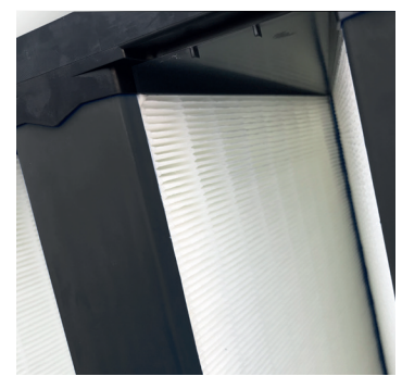
Mini pleat media

The V-Bank Elite Series products are designed and tested to meet the requirements of High Purity critical manufacturing, commercial applications, and laboratories. They are ideal for use in variable-air-volume (VAV) systems due to their rigid nature.