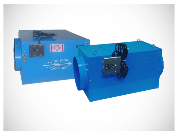
LP-1000 (left) and LP-600 (right)