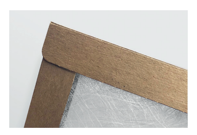
Close-up of channel frame

MANN+HUMMEL offers these disposable panel filters with fiberglass media in a moisture-resistant, Kraft board channel frame. All SelectF filters are one inch deep. The metal-free design allows for easy installation and environmentally friendly disposal.