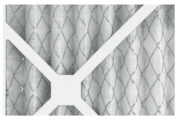
Synthetic mechanical media