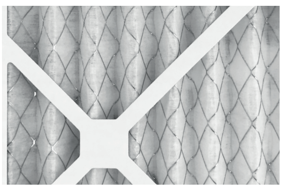
Synthetic mechanical media