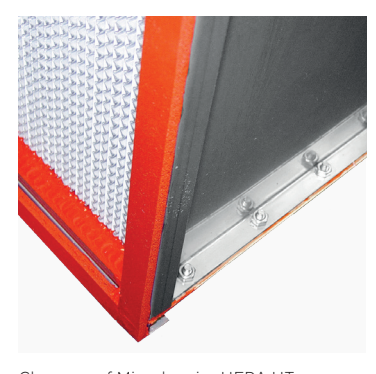
Close-up of Microbarrier HEPA HT frame media pack & sealant

MANN+HUMMEL Air Filtration Americas' Microbarrier HEPA HT & HEPAMAX™ HT filters are designed for the challenging environments of high temperature applications where high demands are placed on HEPA filters. Microbarrier HEPA & HEPAMAX™ high temperature filters are rated up to 500 °F (260 °C). MANN+HUMMEL's quality controlled manufacturing facility ensures that you receive the highest quality products.