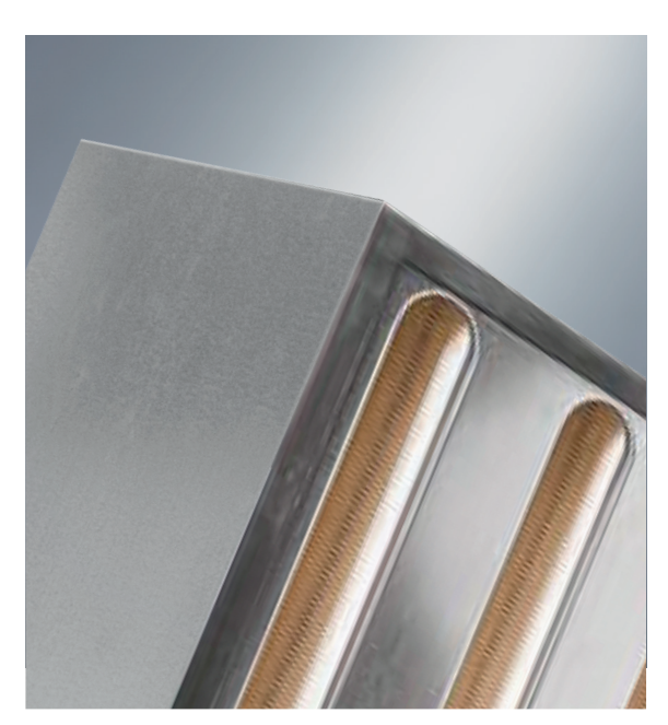
Microbarrier HEPAMAX™ 2400 gasket seal