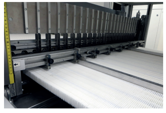
MANN+HUMMFL Air Filtration Americas Cleanroom production area