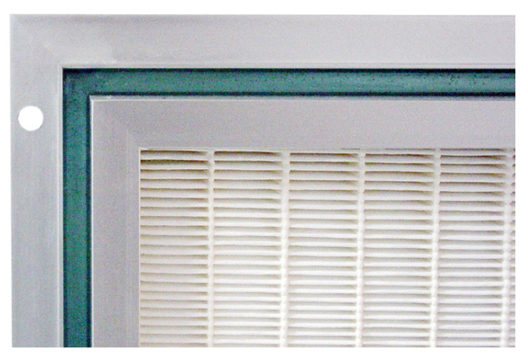
Tri-Pure panel filter showing the reverse perimeter gel seal track and flange used to mount in the module.

In addition to the GSR<sup>2</sup>, Tri-Dim offers the Tri-Pure GSR gel seal replaceable hood—our premium module that offers a full range of features, including an optional aerosol injection port.