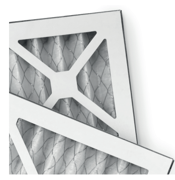
Close-up of Prime8 frame, media & wire