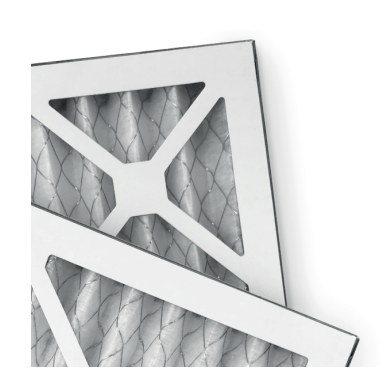
Close-up of Prime13 frame, media