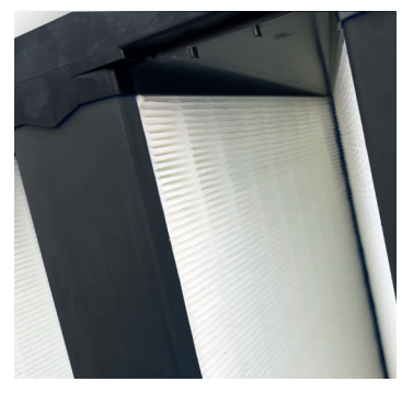
Mini pleat media

The V-Bank Elite Series products are designed and tested to meet the requirements of High Purity critical manufacturing, commercial applications, and laboratories. They are ideal for use in variable-air-volume (VAV) systems due to their rigid nature.