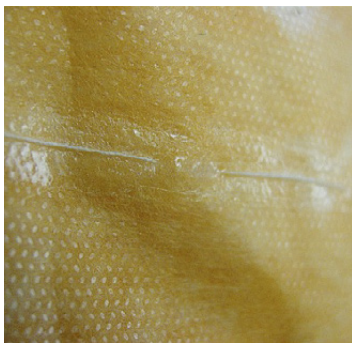
Tri-Sac pockets are span stitched and scrim backed for high levels of protection and durability.