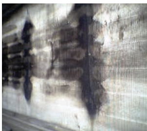
Contaminated HVAC system